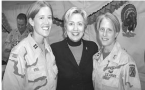
Senator Clinton with two of the 10 th Mountain Division troops that she had Thanksgiving dinner with

At Bagram Air Base, we heard first hand from General Austin and his team about some of the remarkable accomplishments of our troops. We then headed over to the Viper Dining Hall for the first of two Thanksgiving dinners with troops. Seated at my table were troops from the 10 th Mountain Division as well as troops from other units who grew up in New York. It was truly an honor and a privilege to spend Thanksgiving dinner with these brave men and women. We also delivered our first package of letters from New York schoolchildren to soldiers.