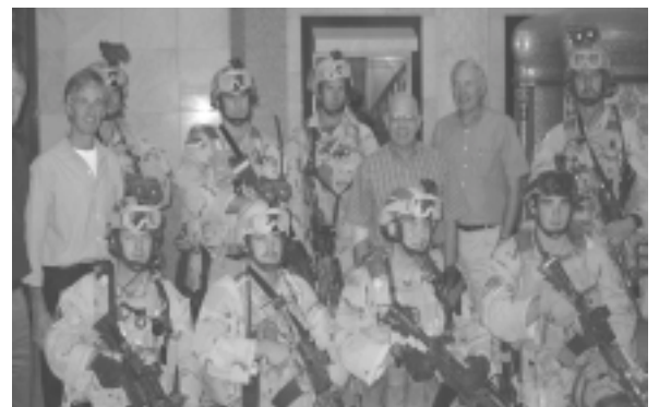
Rep. John M. McHugh and members of a US special forces team in Baghdad, October 11, 2003.

May God bless our soldiers and their families.