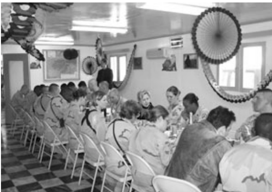
Senator Clinton shares Thanksgiving Dinner with the 10 th Mountain Division and NY troops at the Bagram Air Base

I am very proud of the work that our soldiers are doing in both Iraq and Afghanistan and take special pride in the role that soldiers from Fort Drum are playing in the War on Terrorism. I look forward to welcoming the troops from Afghanistan home this spring and congratulating them on a job well done.